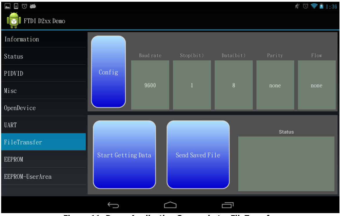
Figure 11: Demo Application Screenshot – FileTransfer

This demo application displays the functionality of UART, but it could receive or send a file.