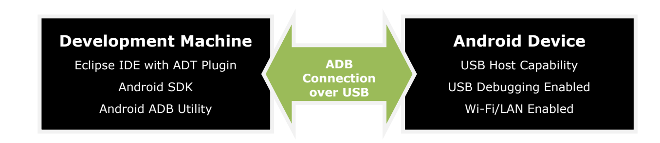
Figure 1: Android Development Configuration

A summary of the required configuration is provided in the diagram below.