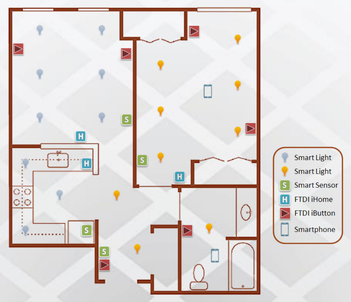
Future Technology Devices International Ltd. (FTDI Chip) www.ftdichip.com

With a practical and intuitive GUI, users can easily setup and configure their smart homes, on-board new devices, create logical groups of things. Presets/scenes can be setup to facilitate user control. Events can be configured to automatically trigger scenes and controls without end-user intervention.